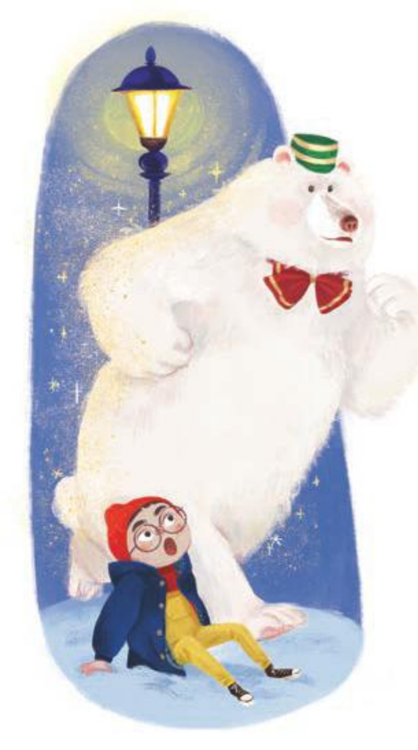
Benji scrambled to his feet and gasped . . .

... he was bowled over by a gigantic polar bear, "Sorry, sorry! I'm late for work!"